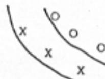
FIGURE 2 -- Chaine. As figure 2 starts W are on the inside circle. They will not complete their avant-deux but will do 1/2 turn CCW to face their ptr.

B 1-2 Join R hands with ptr and move and change places with ptr, using the 2 first meas of "Avant-deux droit." 3-8 Keep moving diag out and in, like in a grand R and L. 1-8(rptd) Repeat meas 1-8, figure 2.