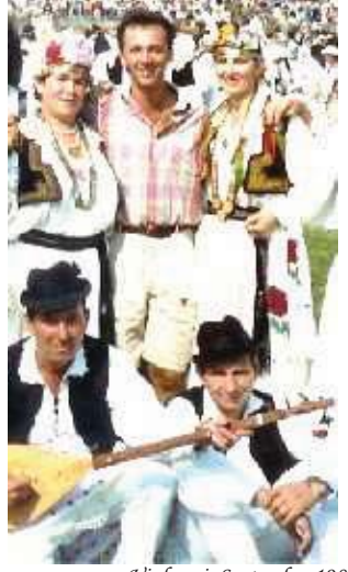
Vinkovci, September 1988.

Moving in LOD – step R, L, R, (cts 1-&-2); hop R (ct &).