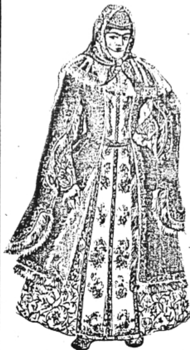
Երևան, տոնական զարդ, 19-րդ դ. Եր. Տ. Գրիգորյան Проздничный костюм. Ереван, XIX в. Худ. Ф. Григорян Yerevan, Costume for Holiday Wear. 19th century. Painted by F. Grigorian