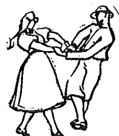
'Råjarn' as a couple

Also see: ' Egerländer Tanzfibel ' Heil, Joseph Egerland Verlag, Geislingen-Steige 1963