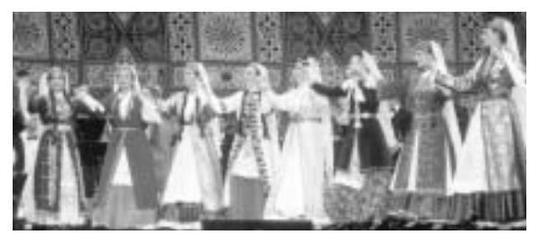
UCSB Middle East Ensemble Dance Troupe performing Jurjina by Tom Bozigian