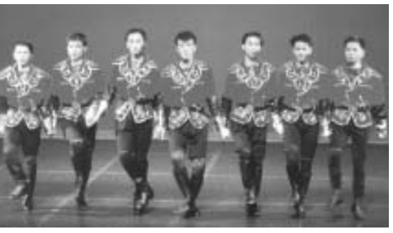
Legacy European Folk Dance Troupe (Hong Kong) performing Vratzakan Bar choreographed by Tom Bozigian