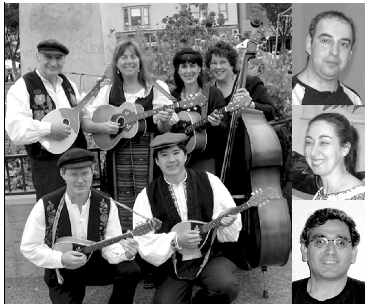
Published by the Folk Dance Federation of California, South Volume 42, No. 4 May 2006