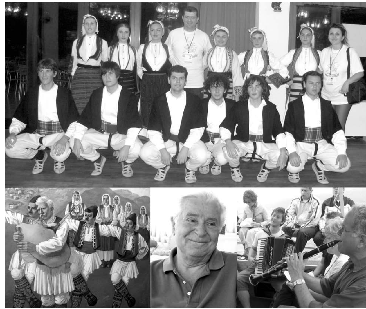
Published by the Folk Dance Federation of California, South Volume 42, No. 8 October 2006