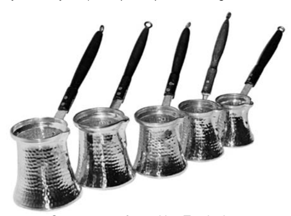
Cezves - pots for making Turska kava

Coffee was brought to the Balkans by the Ottomans. Every Macedonian household has a cezve (or gezve , djezve , or jezve ) – a special pot for boiling coffee.