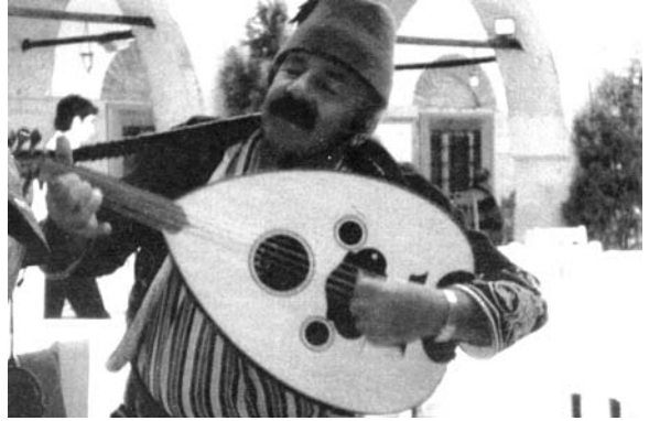
Turkey serenaded us with ancient Mideast folk tunes. and an occasional discourse into "Pink Floyd".

Safronbolu, an inland city north of Ankara and south of the port of Bartin was a fortified stop on the Silk Road caravan route. We were at Hotel Cuici Han, a restored 1100 AD structure which had secure accommodations inside iron doors for silk merchants on floor 2, with camels and drivers in the stables and courtyard below. The best master of the oud in all of