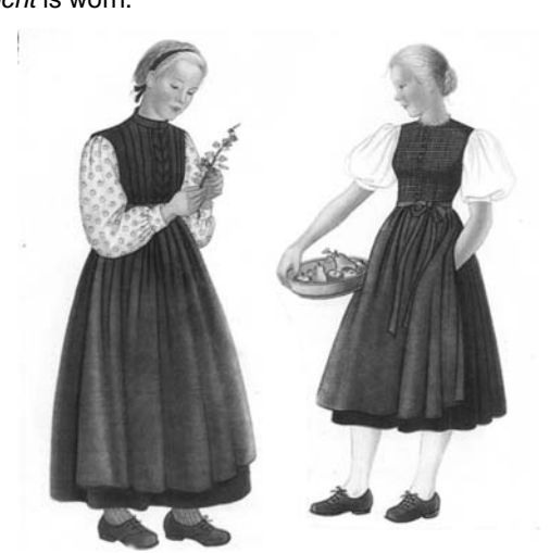
Illustration 1. Renewed Tracht from East Tirol. Here the renewal was more drastic. The long-sleeved printed cotton blouse has been replaced with a white short-sleeved blouse. The bodice that was black with black cloth trim has been substituted by one made of a small checkered red-black linen whose neckline is trimmed with bobbin lace. The skirt is shorter and lighter. Only the apron is the same dark blue linen.

The German language distinguishes between "Tracht", native dress, and "Kostum", costume. The noun Tracht is derived from tragen, to wear. Hence, Tracht is that which one customarily wears. Today it denotes folk and occupational dress. Kostum, on the other hand describes masquerade or theatrical costume, something one wears to appear to be something one is not, a disguise. Tracht is not a Kostum unless it is worn by someone who is not born into or part of the community in which the particular Tracht is worn.