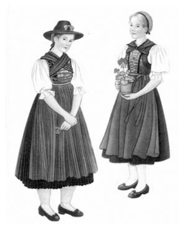
3. This picture shows the Alpacher Tracht and illustrates the step taken to renew the costume and make it more wearable. The waist has been dropped to its natural place, and the bodice that barely reached under the arms has been brought closer together in front, and the embroidery in back has been lengthened. The knitted feetless tubes have been replaced by knitted stockings.

Handicraft Ass.). The goal of this organization was to encourage the production of folk arts and crafts and market these products cooperatively. It was also instrumental in developing patterns, accessories and materials for the renewed native dress. Today the Heimatwerk of each Austrian province carries the items required for the native dress of the various areas in the state, as well as ready-made garments. In addition, the Tiroler Heimatwerk produces native dress for South Tirol, which is now part of Italy. Under the leadership of notable costume scholars and textile experts such as Dr. Franz Lipp and Helene Grun, the renewed native dress has become firmly established and has added to the original simple workday garment forms for all of life's occasions.