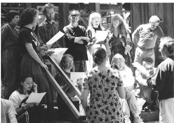
singing in the sun - Mendocino