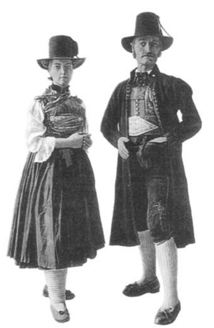
2. Figures in the Tirolean Folk Art Museum, Innsbruck. This is the old Brandenburger Tracht. Notice the very high waist and open bodice on the woman's costume, as well as the tubular, footless stockings.

person among several others, Gertrud Pesendorfer, campaigned for revival of the textile arts necessary for making traditional garments: weaving, spinning, leather work, embroidery (including guill and gold embroidery), etc. Where the old dress forms were very high-waisted, the bodices wide open in front, and the stockings just a knitted, footless tube that was pushed together on the leg to create doughnut-like rings circling the legs, she suggested dropping the waistline to its natural place, closing the bodice, using lighter fabric for the skirts, and, where the heavy skirts had been resting on pillows attached to the bodices, sewing the skirt directly onto the bodice. She sought to develop a garment of dignity and value without fashionable excesses and ornamentation. Above all it had to fit the wearer, be of good quality material and the embroidery and other fine needlework had to be done by the wearer herself. Eventually sewing and needlework courses were established in all Austrian provinces.