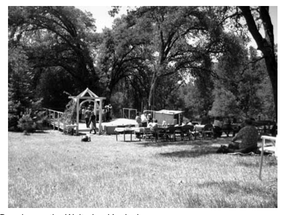
Dancing on the Wolterbeek's deck

Folk Dance Scene August 2008 August 2008 19 Folk Dance Scene