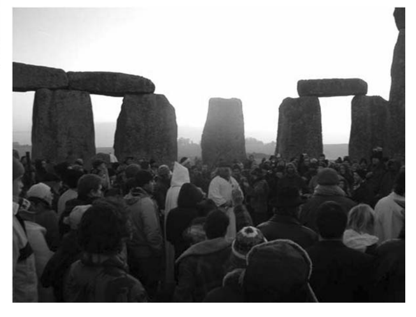
Published by the Folk Dance Federation of California, South Volume 44, No. 10 Dec. 2008 / Jan. 2009