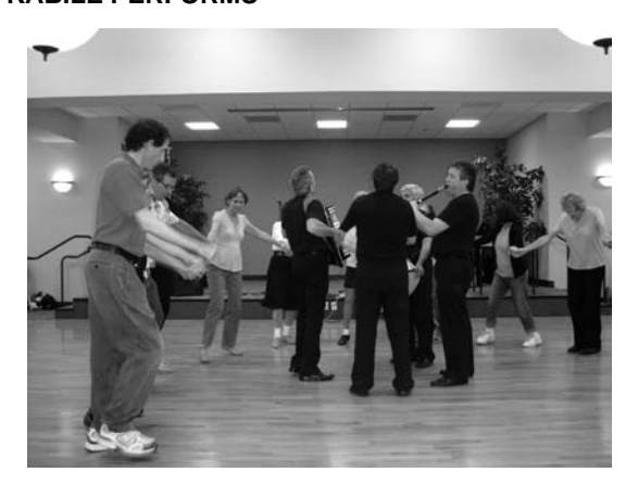
The Kabile Bulgarian band partied with the Laguna Folkdancers Sunday, October 26.