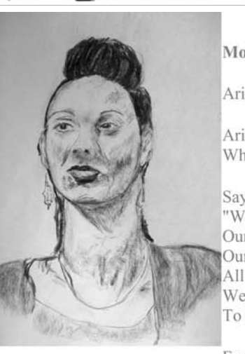
Mother's Day Proclamation