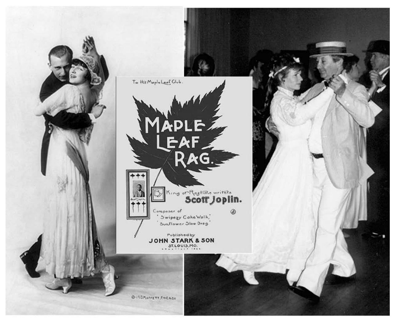
Published by the Folk Dance Federation of California, South Volume 48, No. 3 April 2012