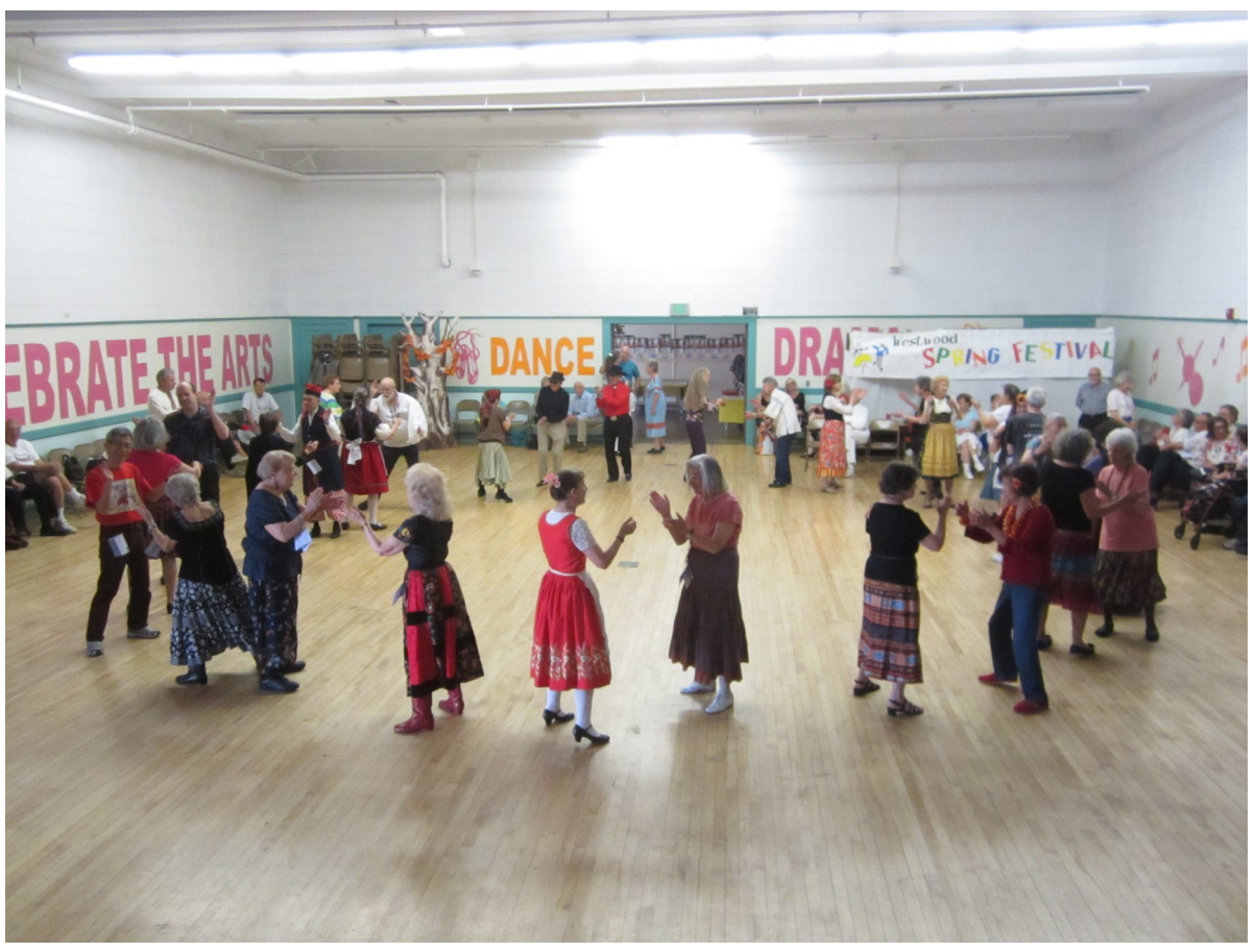
Published by the Folkdance Federation of California, South Volume 51, No. 2 March 2015